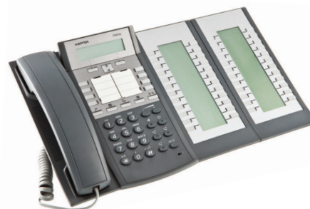
Display Panel Unit (DPU)

There are two different extra key panel options: Key Panel Unit (KPU) and Display Panel Unit (DPU). The Aastra 7434ip can be equipped either with up to three KPUs providing 72 extra keys, or with up to two DPUs, providing 48 extra keys. Power to the modules is supplied by the terminal. Each extra panel unit has 24 additional keys. Extra keys can be programmed locally from the terminal (from a PC via the terminal's web server) or centrally via the management application suite. The DPU has self-labeling keys to enable centrally stored name/number information to be displayed on the panel. This, of course, means that with the free-seating function, individual user data with name/number information will be displayed on the terminal and the DPU as soon as the user logs in.