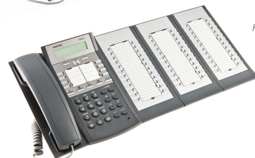
Key Panel Unit (KPU)